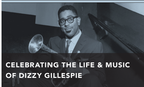
CELEBRATING THE LIFE & MUSIC OF DIZZY GILLESPIE